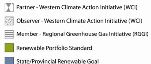
Figure 1: Nearly 40 U.S. states, all eight Canadian provinces, and the majority of Northern Mexico have either mandated or are involved in ongoing initiatives aimed at addressing climate change. High-resolution image available at:

http://www.nerc.com/fileUploads/File/Assessments/climate-map.jpg